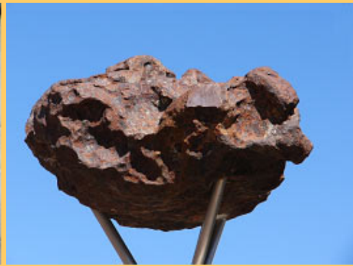
one of the Gibeon meteorites

If you want to buy arts and crafts directly from the artists, try the Namibia Craft Centre in Tal Street (exit the Kalahari Sands complex in Independence Avenue and turn right; at the traffic lights turn right again into Sam Nujoma Drive; at the next intersection turn left into Tal Street). If you love colours and shapes you will want to shop till you drop (get another suitcase in one of the shops stocking leather goods... :-))) ).