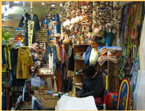
in the Namibia Craft Centre ...