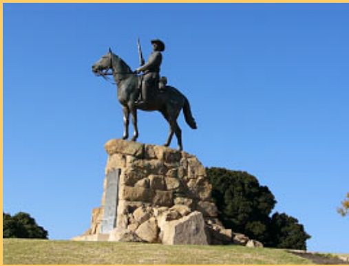
The equestrian statue ...