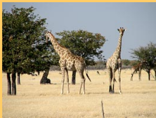
giraffe and ...