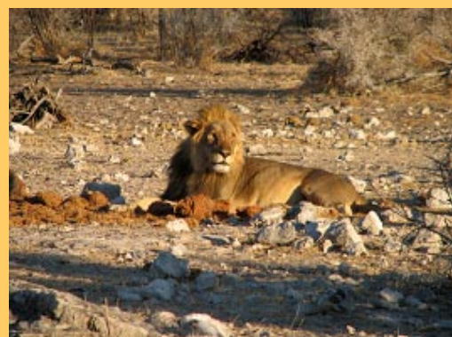
to spot lions in the open