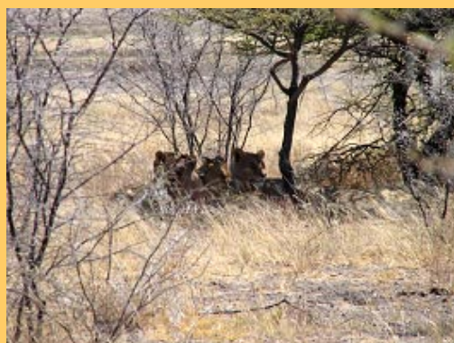
a bit of luck is needed