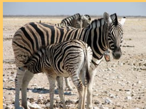
zebra are common sights