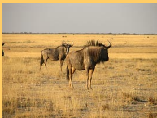
Gnus are rather shy and ...